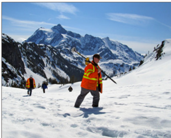
Let's Move Forward offers transportation choices that clean our air and water