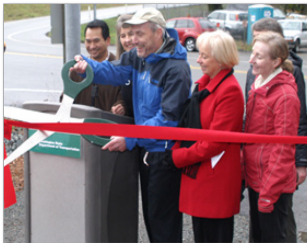
Let's Move Forward includes strong accountability and real reform that changes the way we do business