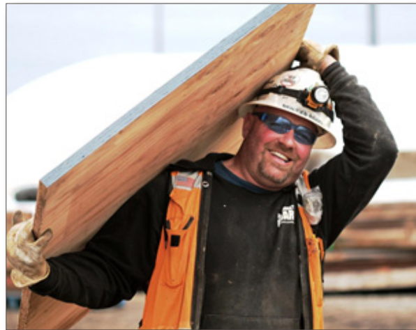
Let's Move Forward provides 50,000 family-wage construction jobs