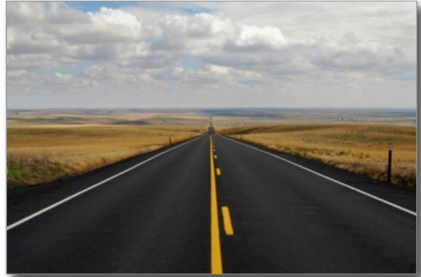
Through practical design and least cost planning, projects will cost less money and meet community needs