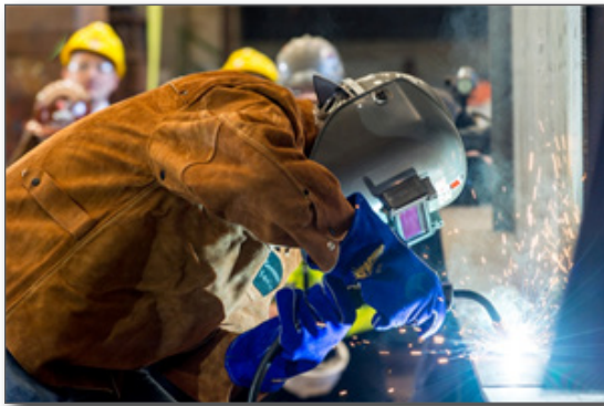
Governor Inslee making the first weld on the keel of the new MV Tokitae ferry vessel

For all of these reasons, Let's Move Forward is offered as a good-faith compromise to spark action. It seeks to bridge the gap on key sticking points, live within our means and strike a balance that makes sense for a majority of the Legislature. Our goal cannot be to get all of what we each might want, but instead to get what the state needs. I'm pleased that legislative leaders and key stakeholders have joined me in supporting this approach.