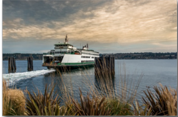
Let’s Move Forward funds training and dispatch upgrades to increase ferry service reliability

Working together, we can protect our environment while reducing the time it takes to get critical projects completed.