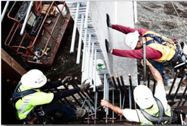
Let's Move Forward includes real reforms and operational efficiencies that save time and money