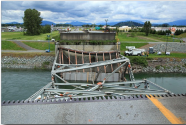
Coordination and collaboration on Skagit River Bridge permitting resulted in significant time savings