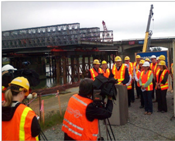
Governor Inslee announces the installation of a new Skagit River Bridge in a record 27 days