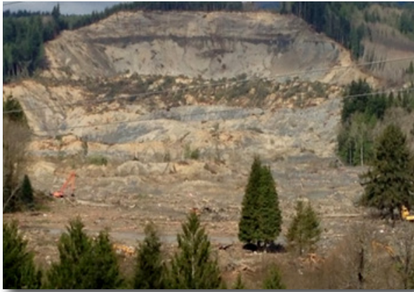
Let's Move Forward funds advanced LiDAR imagery and risk analysis to mitigate future landslides