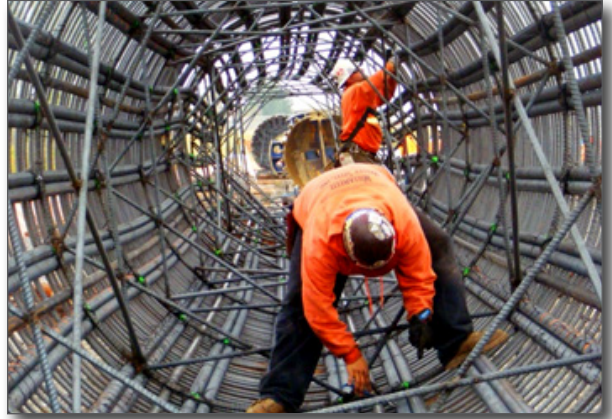
Let's Move Forward requires report cards and checks and balances to give taxpayers the confidence they deserve

Finally, it makes us all safer by funding an Emergency Management Task Force that will ensure the right talent and resources are delivered as quickly as possible to future disasters — whatever they may be.