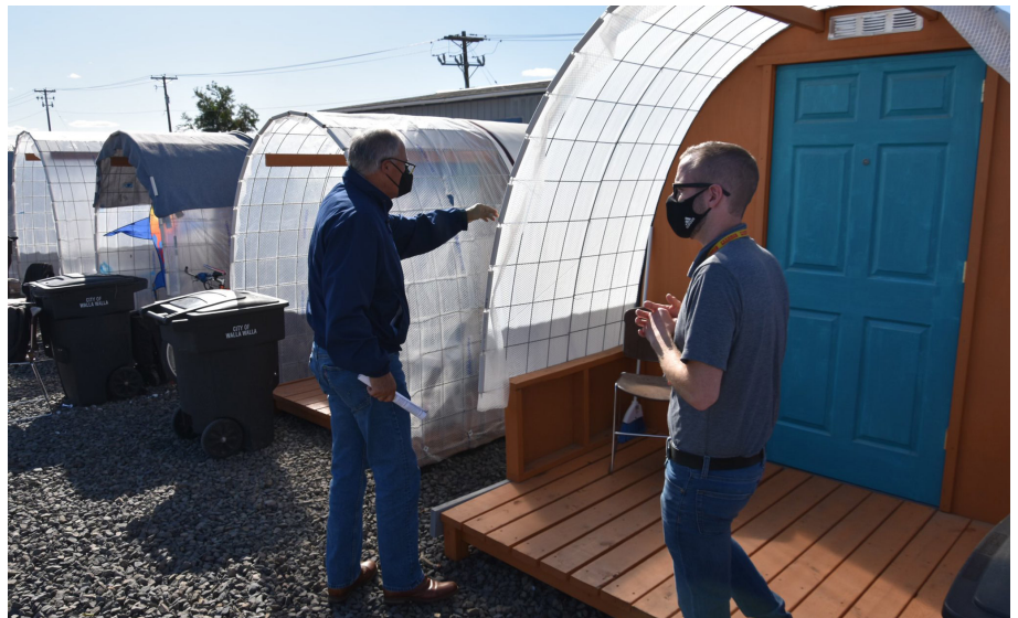
The Walla Walla Alliance for the Homeless Sleep Center provides a safe place for nearly half of the valley’s unsheltered homeless population. On most nights, about 45 people find respite there.

As of October, a high number of Washington households – over 80,000 – reported they were likely facing eviction or foreclosure in the next two months, according to the Census Bureau Household Pulse survey. Meanwhile, due to social distancing requirements to prevent the spread of COVID-19, local shelter capacity has been squeezed.