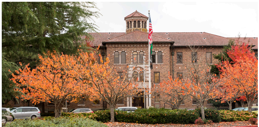
Western State Hospital main entrance

Washington's two primary psychiatric treatment facilities — Western State Hospital and Eastern State Hospital — were built more than a century ago. As demand for behavioral health treatment services has grown in recent